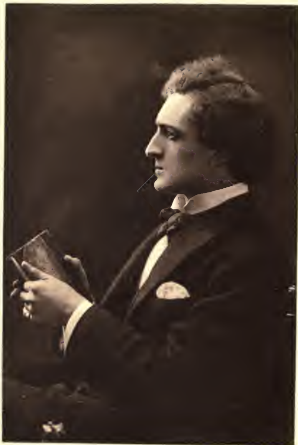
Richard Le Gallienne